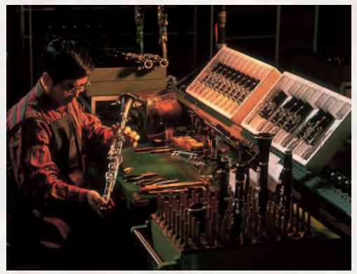
Craftsman makes final inspection of a Yamaha clarinet. All Yamaha clarinets are made by gifted artisans whose fine touch has been developed over long years of apprenticeship to a master.

Yamaha's V Series Custom clarinets represent a pinnacle in the art of clarinet making. Some of the finest instruments ever produced, they are made with a perfect blend of timeless, traditional craftsmanship and cutting edge technology. Precisely balanced and light to the touch, they permit you to effortlessly create the tonal colors you desire—to forget about the technical aspects of your performance and concentrate on pure musicality. And their highly expressive, resonant tone will make you sound good in any concert hall. They are available in two styles, offering finely calibrated differences (bore size, undercuts, etc.) to meet your individual needs.